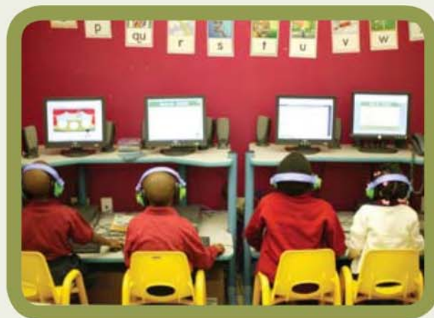
Agassi Prep Elementary School students use classroom technology.